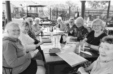
Chi Chapter Celebration Picnic

Chi (Clackamas): Chi chapter celebrated the end of a good year and the accomplishments of busy members.