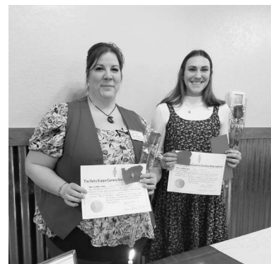
No names provided for which is which--Zeta Chapter