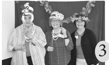
Check out others at dkgoregon.com.