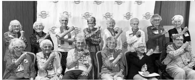
14 of the 15 Rosies present.

We honored the Rosies for four days and did a really good job of it. The Rose Festival Foundation created a spectacular float and invited the Rosies to a reception where they announced that the Rosies were the Grand Marshals of the Portland Rose Festival Grand Floral Parade! The Boeing Company sponsored our float and current Boeing workers walked in the parade with us. The parade route was lined with people cheering. Waving, and thanking our WWII Rosies for their service.