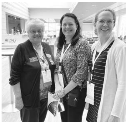
Tampere, Finland, Conference