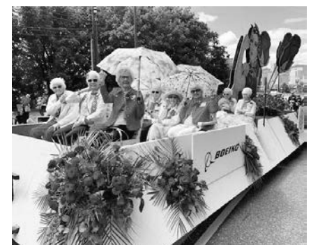
Grand Marshals of the Portland Rose Festival Grand Floral Parade! Riding on the Boeing-sponsored float.