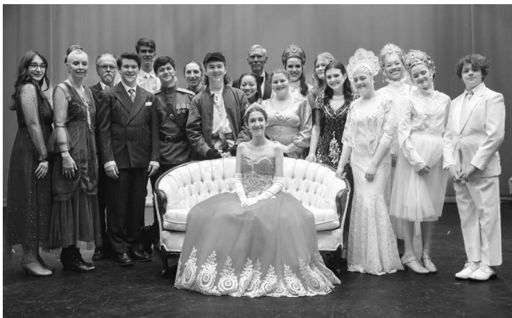
The cast of Anastasia, performed in April by The Non-Stop Players, wear costumes, including items from Russia and Ukraine.

The decision to offer this type of show came after their production of Anastasia , in which they incorporated some costume and prop materials that had been obtained from both Ukraine and Russia.