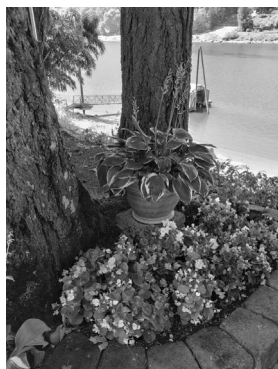
Chi's Picnic Vista

Chi (Clackamas): What a wonderful August night Chi Chapter had as